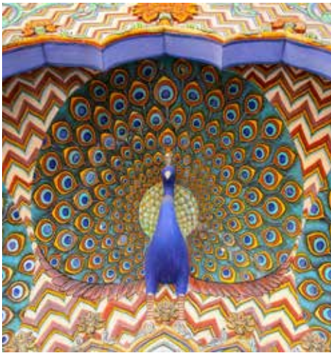
Peacock Gate, Jaipur

After breakfast drive to Delhi International airport in time to catch your flight to next destination. (B)