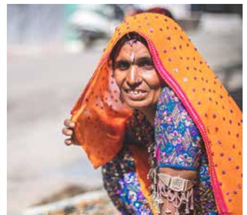
Rajasthani Lady, Udaipur

Depart for romantic city of Udaipur en route visiting Ranakpur - famous for its Jain's temple. Rest of the day is at leisure. Overnight in Udaipur. (B)