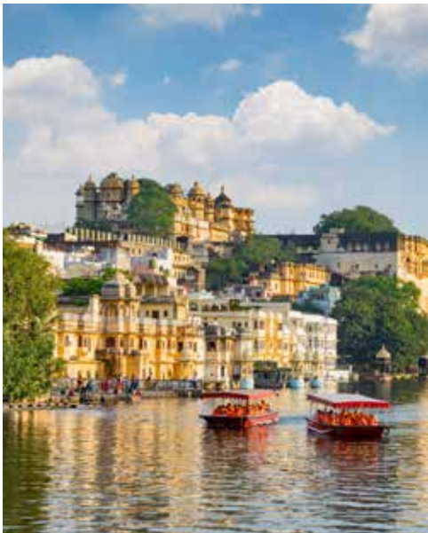
Lake pichola, Udaipur