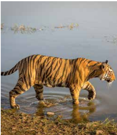
Bandhavgarh National Park