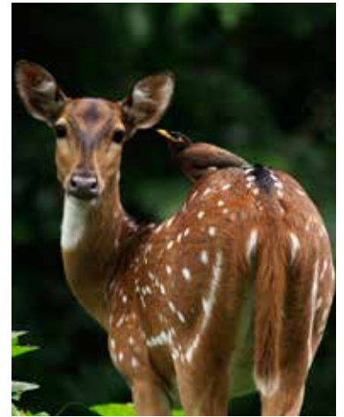
Deer at Bandhavgarh National Park