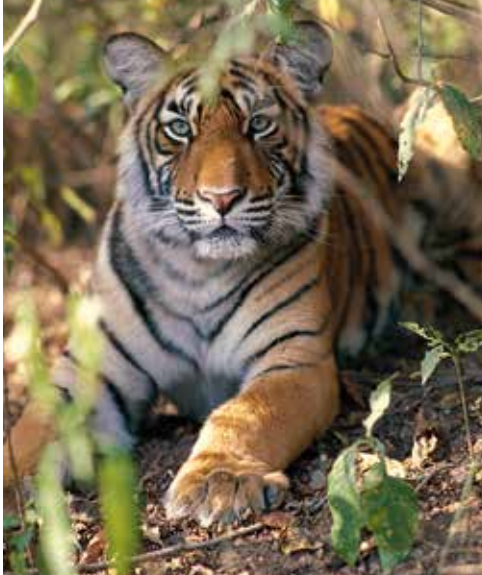
Relaxing Tiger, Kanha National Park

After breakfast depart for Kanha National Park and check in to your lodge. Overnight in Kanha. (B,L,D)